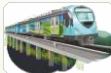
Metro Rail Starts From RFC